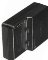
DMW-BTC10 Series Battery Charger