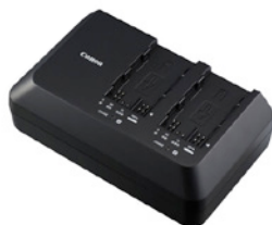
Battery Charger for EOS C300 Mark II, C200, and C200B Batteries