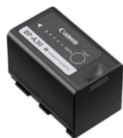
BP-A30 Battery Pack For EOS C300 Mark II, C200, and C200B