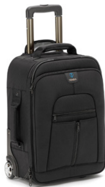
TENBA | Roadie II: Universal Hybrid Roller Backpack