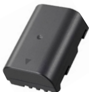
DMW-BLF19 Battery for the GH4 Camera