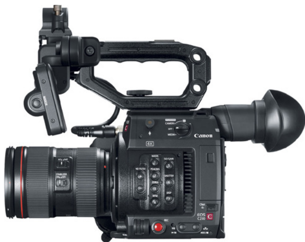
CANON | EOS C200 EF Cinema Camera and 24-105mm Lens Kit

Today, we have compact, light and affordable cameras that shoot in the dark, and capture stills, as well as 4K video. But we must always use the best tool for each job. The footage from the Panasonic GH5 is remarkable, and the camera delivers a lot of bang for your buck. For hybrid and especially-low-light situations, I use the Sony a7 III. For more cinematic approaches, the Canon C200 is my weapon of choice. I strongly recommend matching cam A and cam B, or dedicating one for video and the second (identical camera) for stills and B-roll. Having the same brand, model and firmware makes things easier, plus the batteries, chargers, media and lenses are all the same. With the addition of an external monitor/recorder like the Atomos Ninja Inferno, one can record Apple ProRes or Avid DNxHR directly into Solid State Drives, saving time and headaches in post.