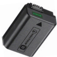
NP-FW50 Battery for the a7SII Camera