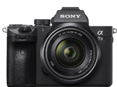
SONY | A7 III Mirrorless Digital Camera