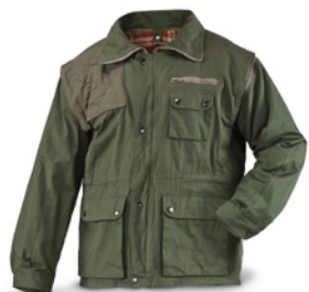
NEW HUNGARIAN Forestry Surplus Lined Hunting Jacket with Zip-off Sleeves