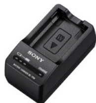
BC-TRW W Series Battery Charger