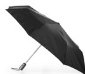
TOTES Raines 10-Ounce Auto Open Mini Travel Umbrella

I always bring gloves unless I'm going to the Caribbean in July. A cashmere sweater is worth its weight in gold. Black hides dust and stains very easily. A "Boonie" hat is another essential item.