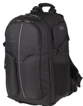
TENBA | Shootout Backpack (24L)

I rely on Tenba to protect my gear. My backpack is the Tenba Shootout. It's small enough to fit carry-on limitations, but large enough to hold the most essential items. Plus, it is extremely comfortable. My clothes, toiletries, and any non-essential gear go in a Tenba Roadie II Universal Hybrid Roller/ Backpack. I bring a variety of Tenba Tool Boxes to neatly organize all the batteries, chargers, cables, adapters and other small accessories.