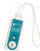
LEWIS N CLARK Travel Door Alarm