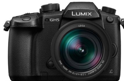
PANASONIC | GH-5 Mirrorless Digital Camera