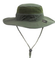
CAMO Coll Outdoor Sun Cap Comouflage Mesh Boonie Hat